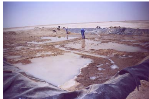
Layering and Watering Continues

water injection system was incorporated through the same aeration adduction pipes so that bacteria would multiply and prevent the soil from drying out. The leachate was settling by gravity on a high-density polyethylene (HDPE) geo-membrane surface with incessant percolation up and down.