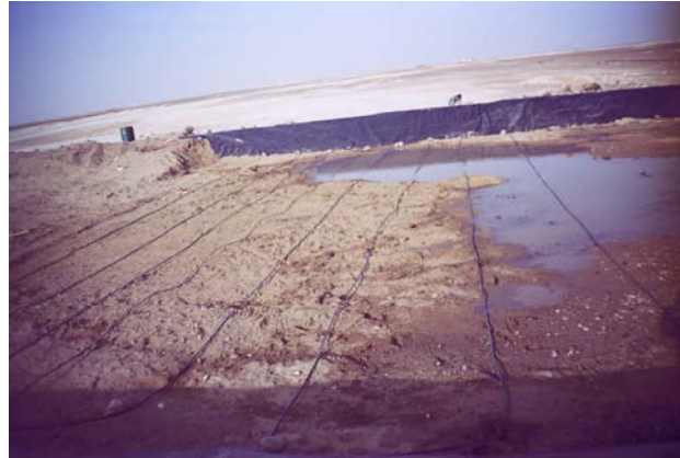
Laying of Adduct Pipes & Aeration

These infiltration galleries which as dynamic in-situ treatment systems are designed to stimulate microbial activity and subsequent hydrocarbon degradation by circulating nutrient and oxygen-amended water through hydrocarbon-contaminated soil. The re-circulating leach beds are in a way similar to slurry reactors. They in fact aerate and mix nutrients with contaminated soil, and can be considered as on-site bioreactors .