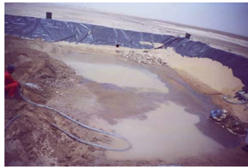
Layer and Dosing

During layer constructions, the moisture and nutrient concentrations in the soil were set at an optimal level to promote and accelerate the development of a hydrocarbonphile bacterial population. The bacterial culture, S-Oil Treat was used as a structuring agent to mix with the soil. During treatment, the zigzag-piping network circulated air and maintained healthy reproductive conditions for the bacterial soil aided by rich nutrient Nutrient- 8 (rich in Nitrogen and Phosphorous) and accelerated the decomposition of Hydrocarbon, promoted by drastic reduction of surface tension by AQ 2000. The stubborn rocky material was pretreated with AQMA 2000 (accelerated). Ample nutrient supply (Nutrient 8 based on Nitrogen and Phosphorous) engendered the sustained bacterial action.